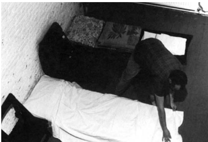
Jan Mlčoch, Noclehárna / Free Dormitory, De Appel, Amsterdam, 1980