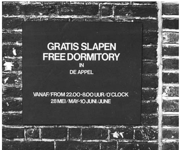
Jan Mlčoch, Noclehárna / Free Dormitory , De Appel, Amsterdam, 1980

Obálka katalogu výstavy / Cover catalogue Works and Words , De Appel, Amsterdam, 1979